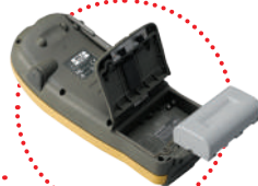
Removable Rechargeable Li-ion Battery